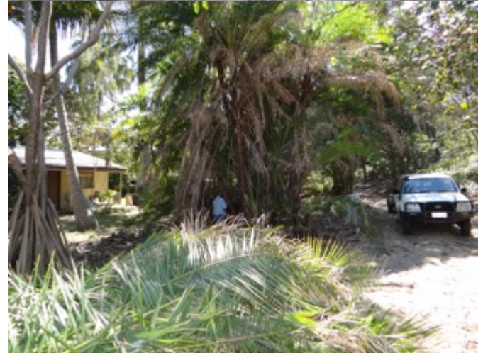
The above two photos were taken at lunch-time. Ten trailer-loads of frond and trunks were removed.