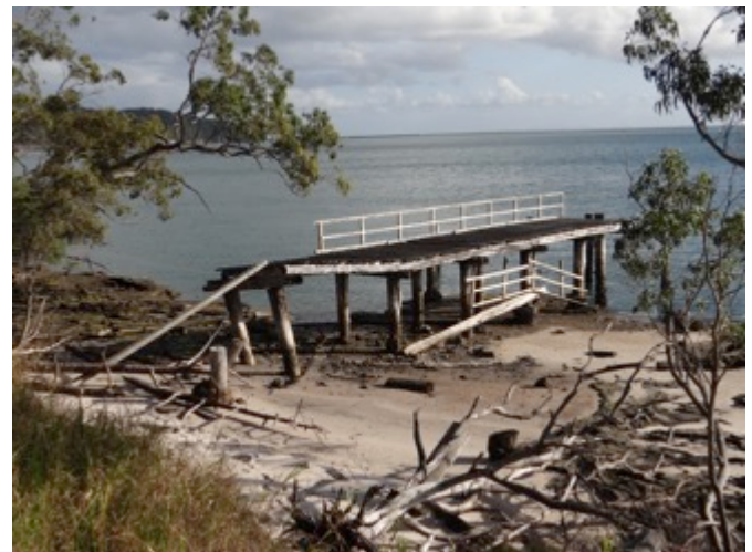
Disintegrating Ungowa jetty on Great Sandy Strait