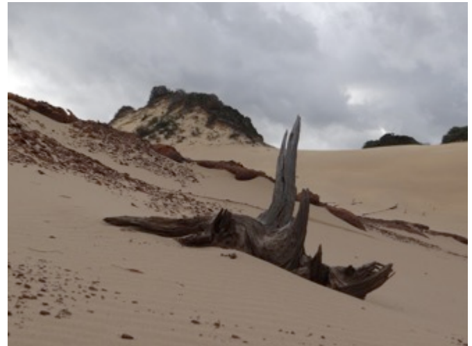
Sand-blasted wood, lateritic cappings and wind-swept mobile sand characterize Kirrar Sandblow