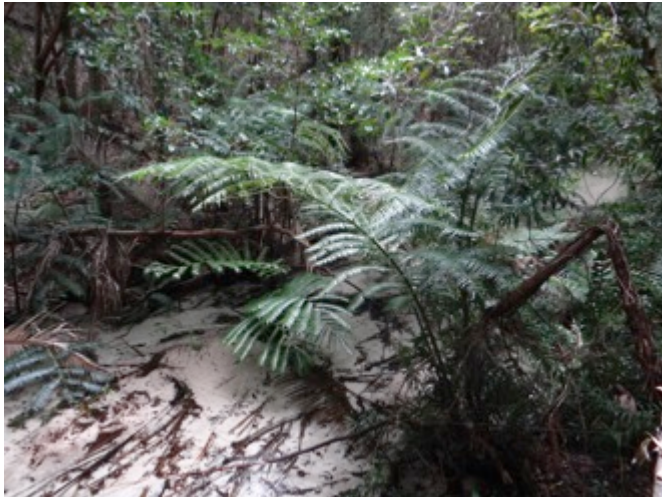
Angiopteris at Central Station

It was very satisfying work that had to be put aside to fit the day's schedule of Morning tea at Central Station and lunch at Lake McKenzie (Boorangoora). The team except for Su who worked on throughout the day on Coral Creeper then set off to Central Station.