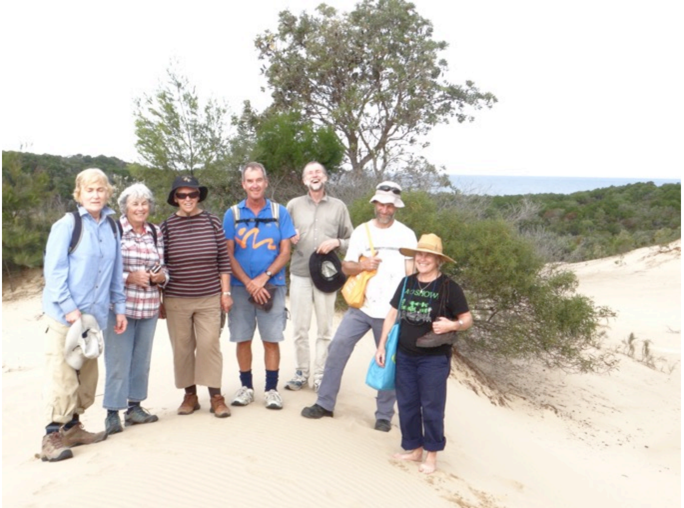
The team at Hammerstone Sandblow with the bed of a once perched dune lake to the right and the sea and encroaching vegetation in the background