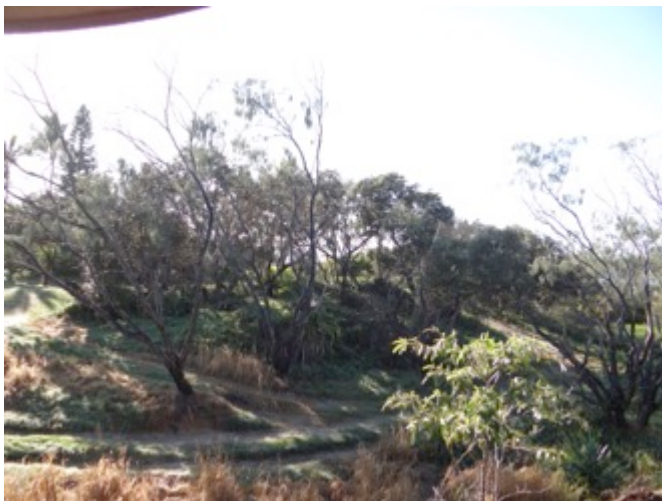
Monitoring Shot Problem Corner July 2015

The areas outside the dingo fence on the north side have been thoroughly purged for isolated occurrences of Coral creeper. There are still many coral creepers in Eurong and a large seed bank that may be triggered following the installation of a new grey-water distribution system for the Resort. It will require constant monitoring and continual follow-up to control.