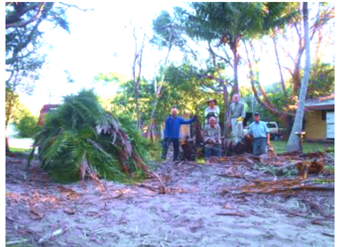
Five triumphant tree fellers astride the stumps