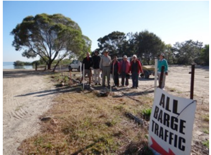
The team planted, weeded and watered while waiting at Wangoolba Creek ferry terminal

another reason to come from the other side of the continent.