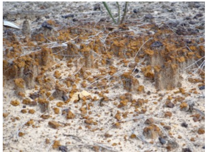
Ironstone nodules formed from the iron in the cell membranes of dead cyanobacteria

At 3.00 pm after really tiring work with 14 plastic bags filled the Fearless Leader called a halt to any further weeding as otherwise the group would miss out on reaching Wabby Lakes. The area weeded mainly was the section between 25°28'5" S and 153°08'32" E (Where the walking track and Quad track join inland from the beach) and 25°28'3" S and 153°08'35" E (In the patch of ancient melaluecas).