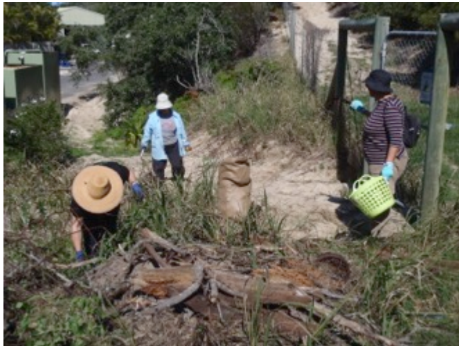
Hunting coral creeper was the largest task undertaken in a very productive week

After smoko three teams set out in different directions. The Women's team led by Su started work at the toilet block end working towards the Dingo grid eliminating Coral Creeper. They made meticulous progress finding larger plants that had evaded earlier treatment but the majority being small plants easily removed. They will return to the job tomorrow.