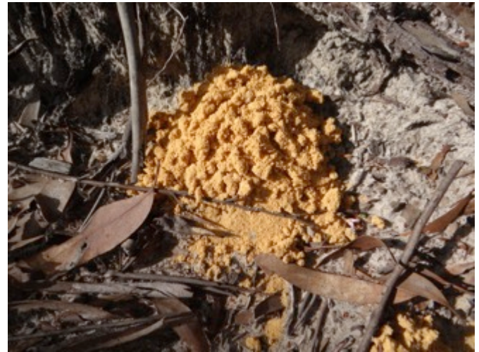
Worm castings painted the road down-cutting